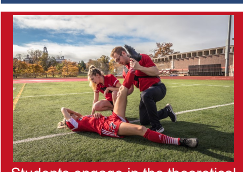
Students engage in the theoretical principles, practical skill development, and experiential learning opportunities to learn about the prevention, assessment, and management of injuries in sport and physical activity. *pending accreditation from the CATA.