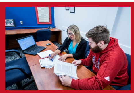
The Honours is a challenging program for students who have a particular interest and desire to pursue further learning in a specialty area.